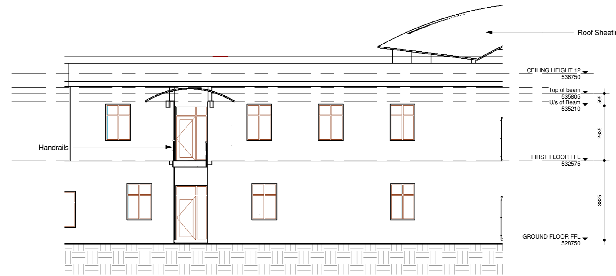
4 North West Elevation 2 1 : 100