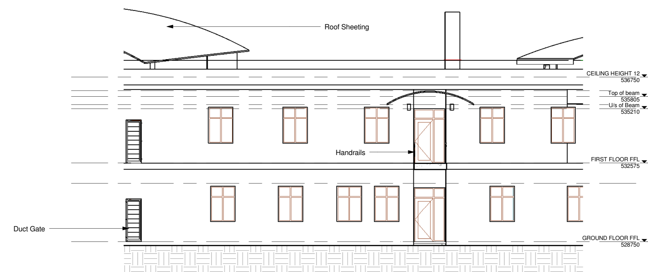
4 North West Elevation 1 1 : 100